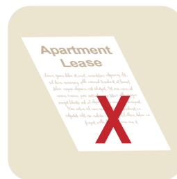
Not Listed on Lease (Census Does Not Report to Landlords)