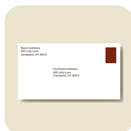
"Permanent Address or Domicile" Listed Elsewhere