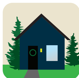
Return Home Every Summer