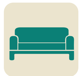
Homeless/ Couch Surfing