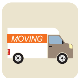
Planning to Move Soon/Recently Moved