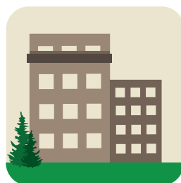
Live in Off-Campus Rental