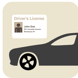
Voter and Driver's Registration Elsewhere