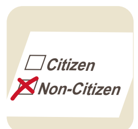
Not a US Citizen (Census does not share with law enforcement or ICE)