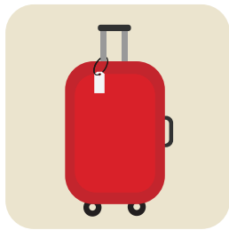
Living in Split Household /Go Home on Weekends

Some of the most at-risk for not being counted include students in the following situations: